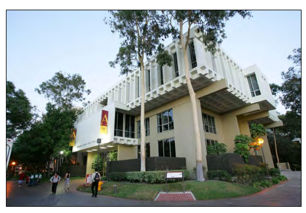
Annenberg School for Communication & Journalism